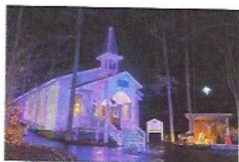
Dollywood's Chapel at Christmas Wednesday, Nov. 14